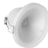
PRE TINO WATT : 6W CCT : 3K, 4K DIMENSION : 92 X H 58 MM CUTOUT : 65 MM