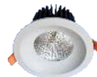
PRD COB CON RD 20W 3K, 4K, 6K 135 X H 105 MM Ø110 MM