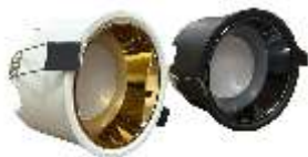
WISP 1A / 1B WATT : 7W CCT : 3K, 4K, 5K, 6K DIMENSION : 70 X H 55 MM CUTOUT : 60 MM