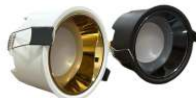
WISP 3A / 3B WATT : 18W CCT : 3K, 4K, 5K, 6K DIMENSION : 98 X H 65 MM CUTOUT : 88 MM