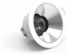
PRE RECO WATT : 6W CCT : 3K, 4K DIMENSION : 89 X H 52 MM CUTOUT : 65 MM