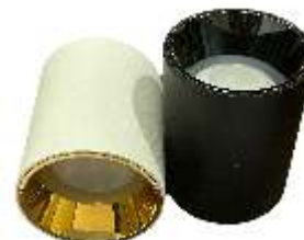
CRISP 3A / 3B WATT : 18W CCT : 3K, 4K, 5K, 6K DIMENSION : 98 X 65 MM