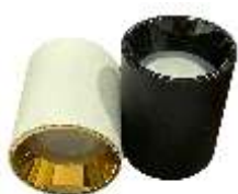
CRISP 1A / 1B WATT : 7W CCT : 3K, 4K, 5K, 6K DIMENSION : 55 X 70 MM