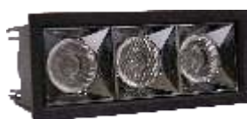
RAGA 2A / 2B WATT : 3 X 4 W CCT : 3K, 4K, 5K, 6K DIMENSION : 128 X 50 MM CUTOUT : 118 X 42 MM