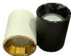
CRISP 2A / 2B WATT : 12W CCT : 3K, 4K, 5K, 6K DIMENSION : 88 X 60 MM