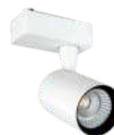
PRE CONNECT 2B 30W 3K, 4K, 6K 80 X H 160 MM