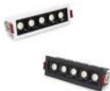
TAGO 1A / 1B WATT : 5 X 2W CCT : 3K, 4K, 5K, 6K DIMENSION : 146 X 44 MM CUTOUT : 137 X 35 MM