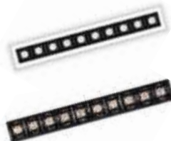
TAGO 2A / 2B WATT : 10 X 2W CCT : 3K, 4K, 5K, 6K DIMENSION : 281 X 44 MM CUTOUT : 271 X 35 MM