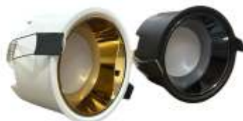
WISP 2A / 2B WATT : 12W CCT : 3K, 4K, 5K, 6K DIMENSION : 88 X H 60 MM CUTOUT : 75 MM